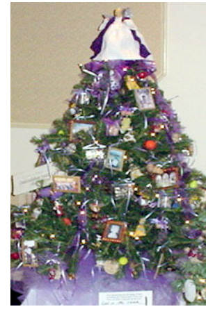
The Result! Bravo

YEAR: 2003 – Celebrated by our Directors