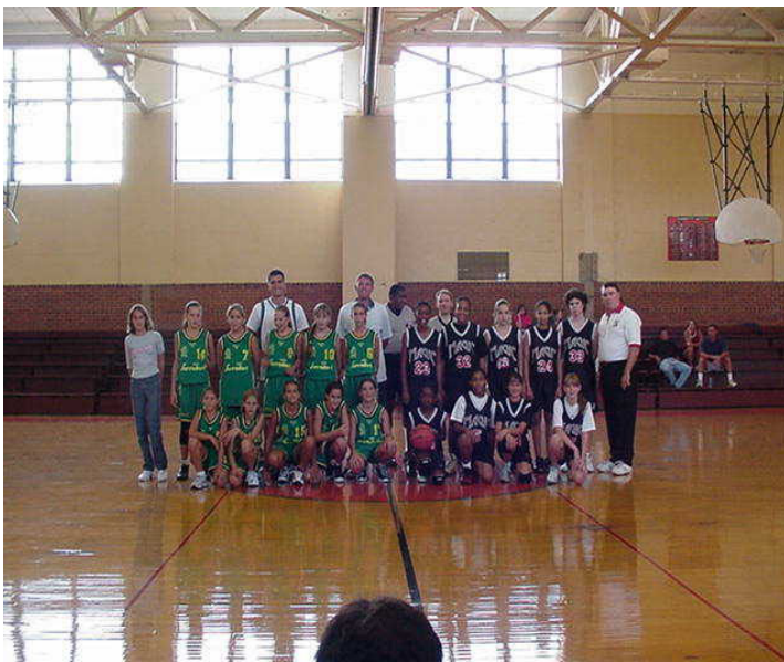
Girls Team with coaches

In August we experienced the First Sports Exchange (known as the F2 Games) were held. It was believed to be the first exchange of young basketball players in the history of Sister Cities International. FSCA received an international award from SCI for these exchanges.