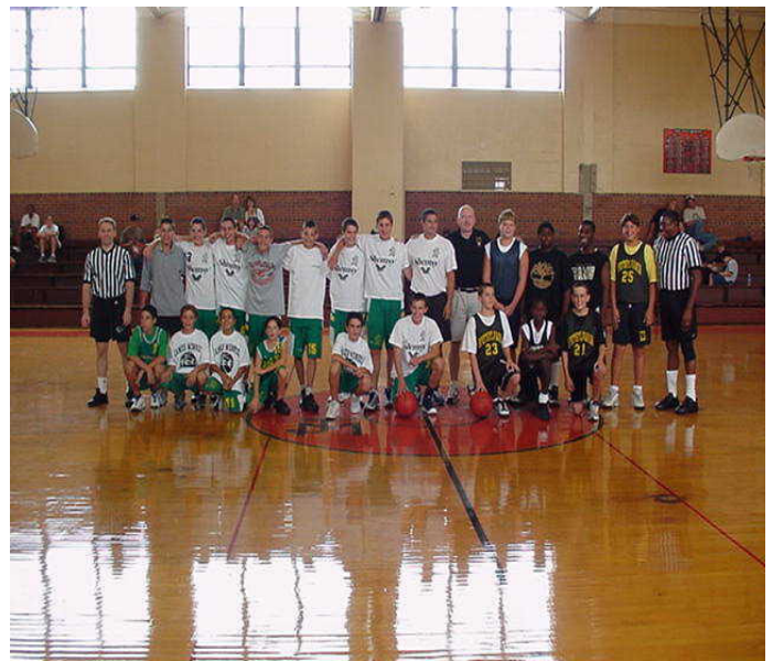
Boys Team with coaches