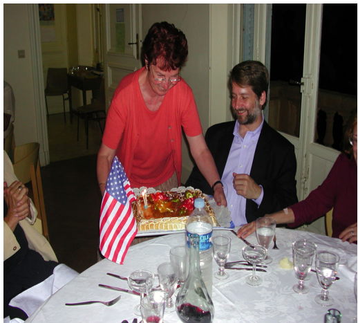
Happy Birthday Mayor