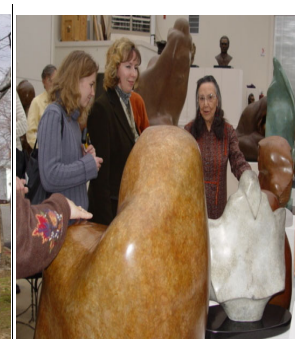
Visiting Gambaro studio