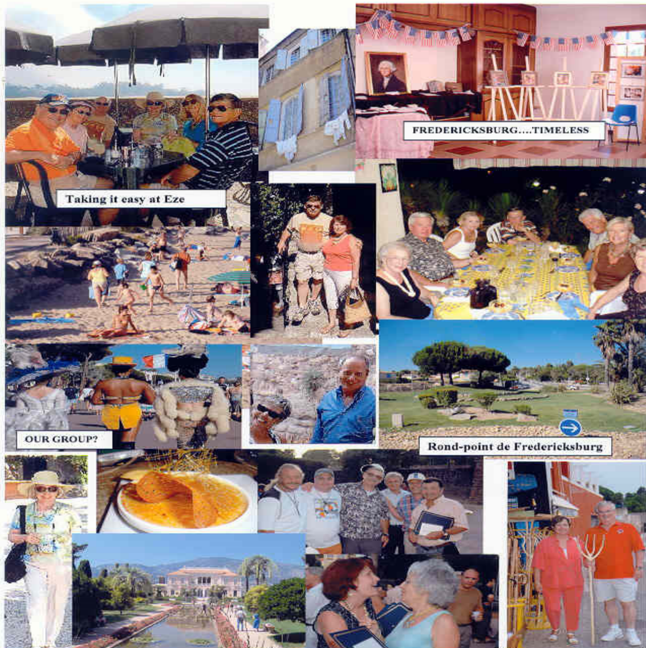
Eight Fredericksburg artists presented an exhibitions of art during the celebration.. The Theme” Fredericksburg....Timeless”