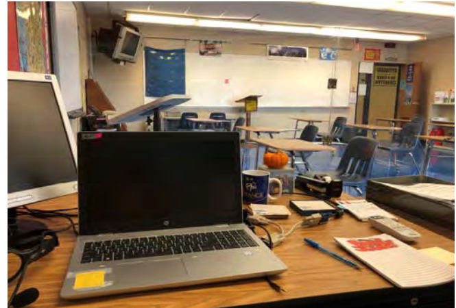
SMS Classroom – broader view

And then there are the other students, approximately 20% of my students, who are failing French I! This is the highest failure rate I have ever experienced in all my years of teaching! Am I a bad teacher? I refuse to give a passing grade to those students who do nothing! Those students do not complete assignments or attend Google Meets on a regular basis. The reasons are as varied as their personalities. A few reasons include: computer device not working or wifi issues, babysitting for younger siblings, no quiet place to work, no parent support and so on.