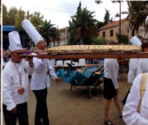
And here comes the bread