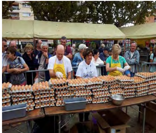
Time to crack some eggs