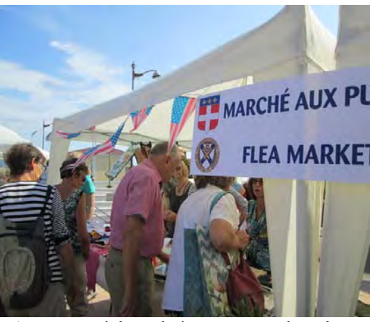
Art & special made items were abundant.