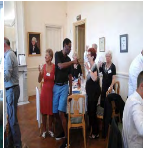
Cheers by everyone