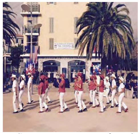
Fréjus Western Dancers performed. Note the sign over Tourism office