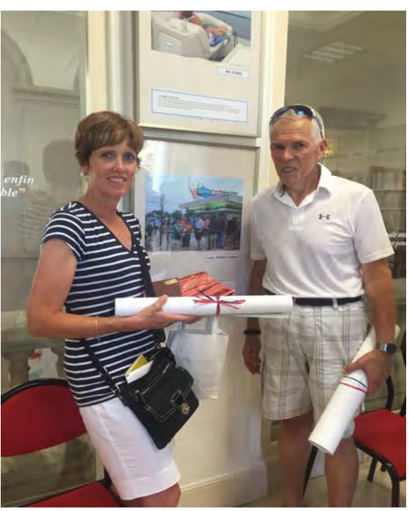
1<sup>st</sup> Prize "Carl's Ice Cream in the summer" by Leigh/Bob was recognized too Everyone with a photograph in the Exhibition was recognized at the Reception