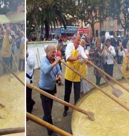
Now everyone stirs, .... and stirs, .... and stirs