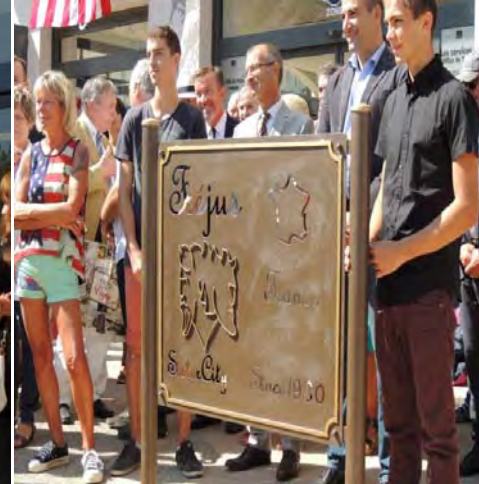
Gift from Fréjus to Fredericksburg Shown with young men who Fabricated the sign.