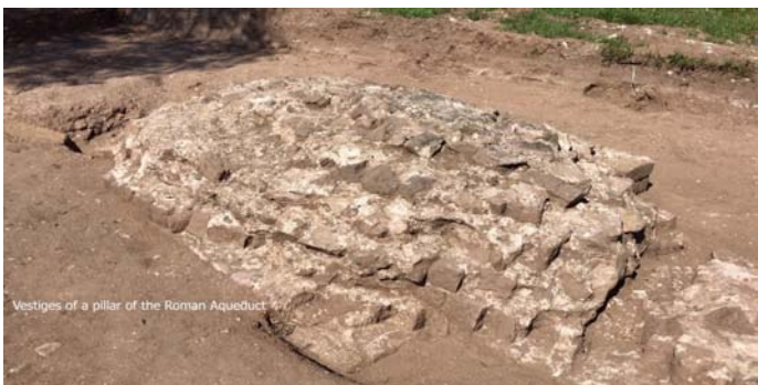
Vestiges of a pillar of the Roman Aqueduct