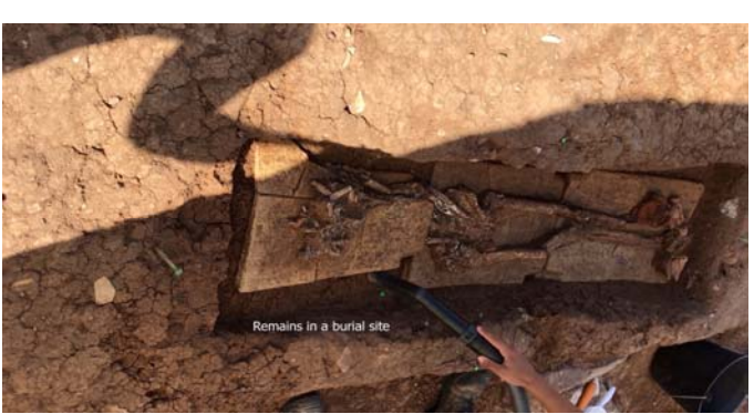
Remains of a burial site