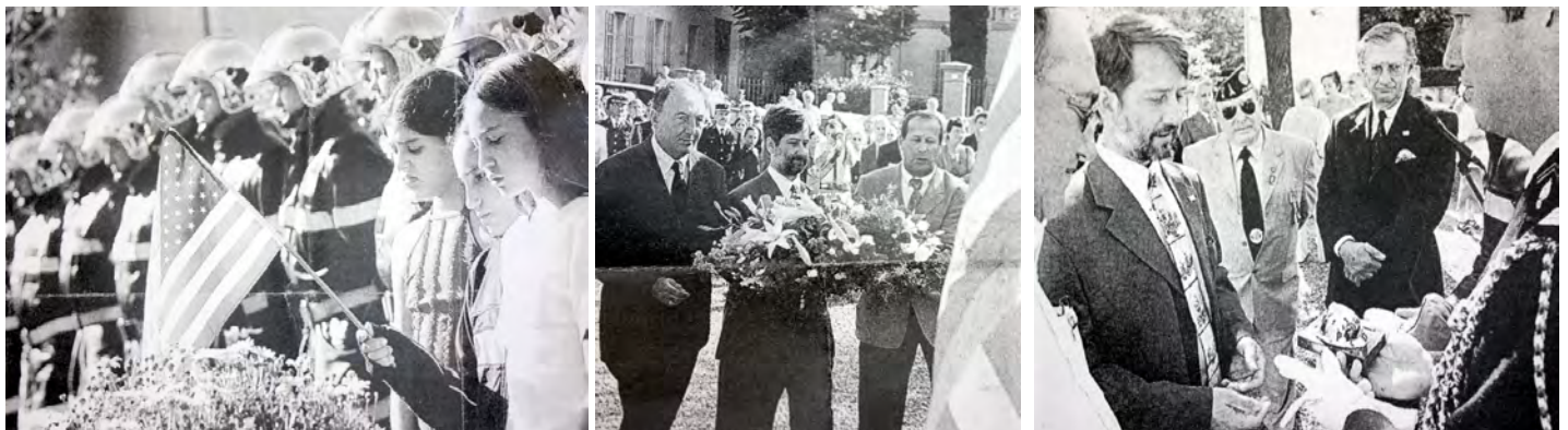
These three photos from the Nice Matin newspaper